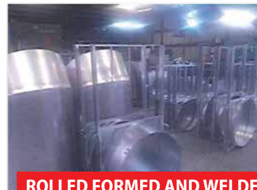
ROLLED FORMED AND WELDED

A worldwide leader in specialty building products