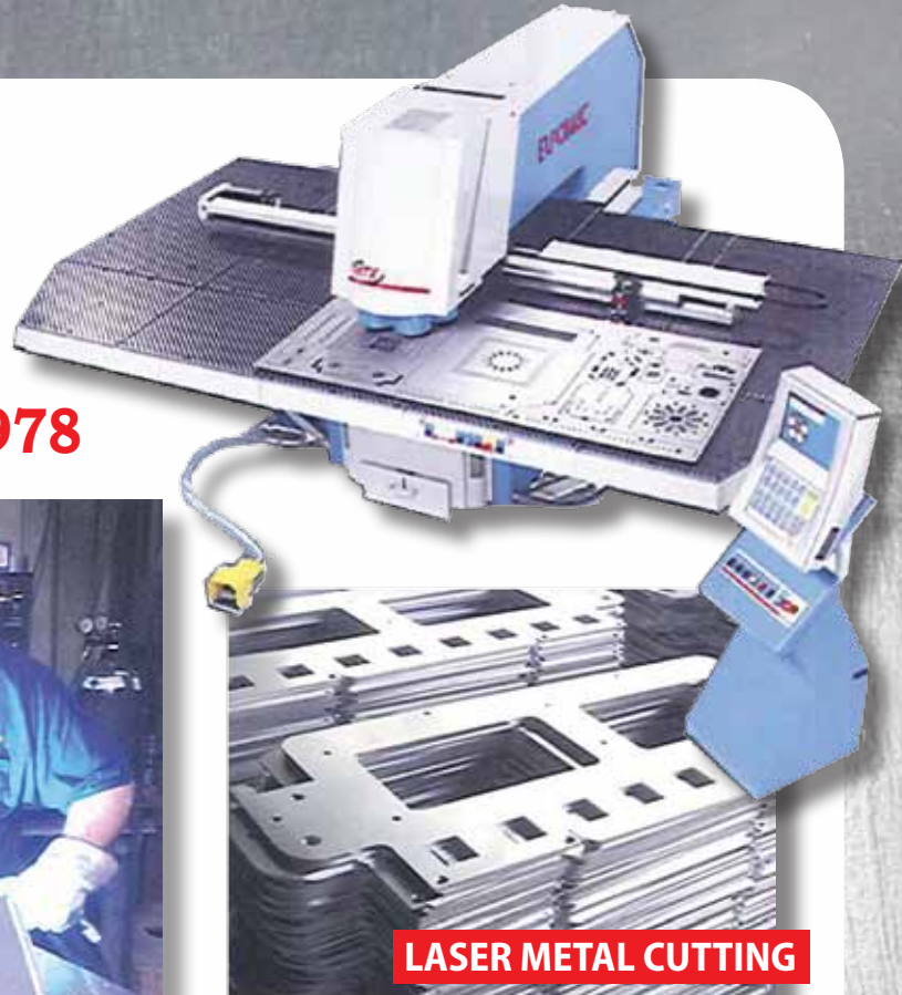
LASER METAL CUTTING

SHEARING ♦ POWDER COAT PAINTING ♦ METAL FORMING AND FABRICATION ♦ FULL IN-HOUSE CAD DESIGN AND ANALYSIS SUPPORT also: METAL JOINING EQUIPMENT METAL SHEARS ♦ IRON WORKERS ♦ ASSEMBLY STATIONS