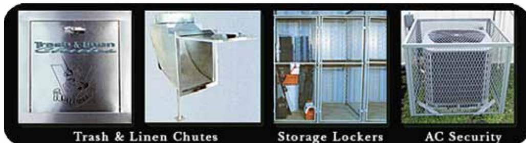
Trash & Linen Chutes

Valiant Products, Inc. has more than 75 years experience in the manufacturing of trash, linen, debris, and residential chutes, and the first chute company to offer residential storage lockers also manufactured by Valiant.